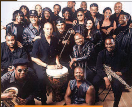
Sounds of Blackness

A Journey to Healing: Finding the Path will appeal to advocates, practitioners, researchers, domestic violence survivors, educators, policymakers, and other stakeholders with an interest in or responsibility to attend to the welfare of battered women and their families. For more information about this pioneering event, visit IDVAAC online at, www.idvaac.org .